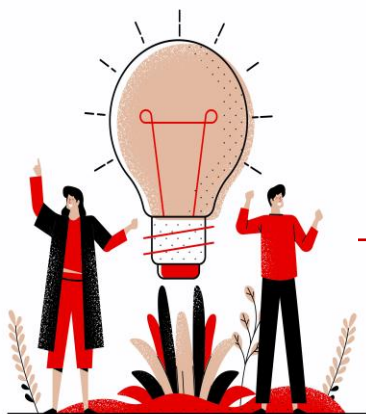
Idea Application (10 th to 24 th March, 2022)