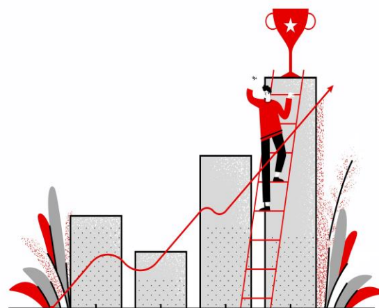
Final List for Support