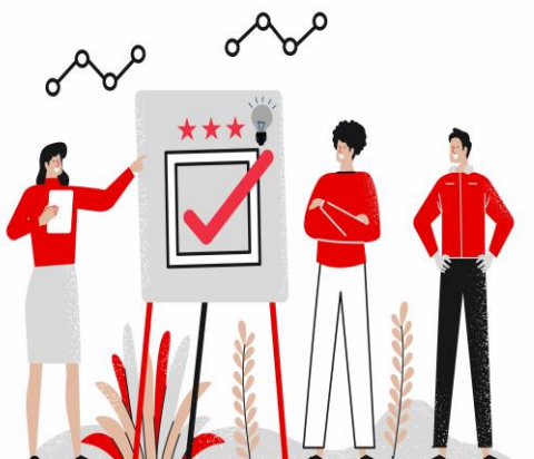
Final Selection by PMAC