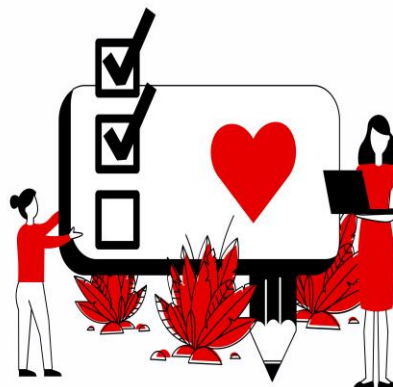
Evaluation by Host Institute