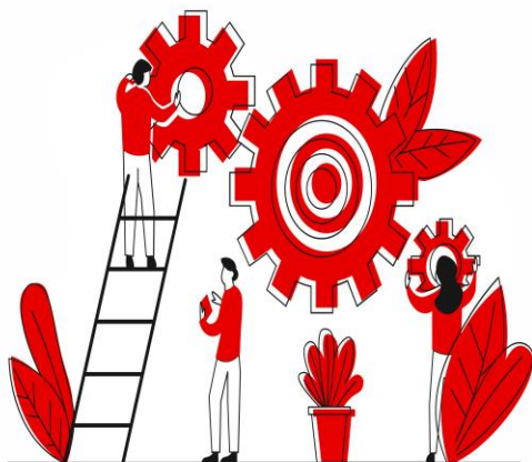
Evaluation & Shortlisting by DESC