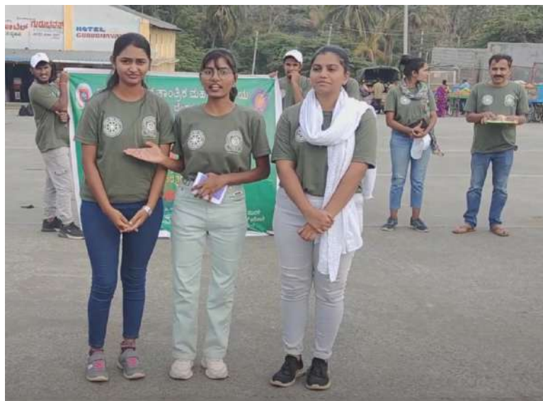
Part 4 of the play.

Aim : Avoid deforestation, Nature is our Future.