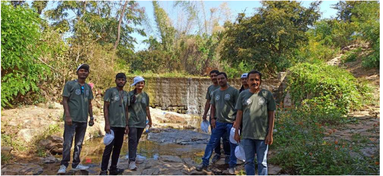
NSS Volunteers along with NSS Coordinators heading towards Nagmale with great energy and enthusiasm.