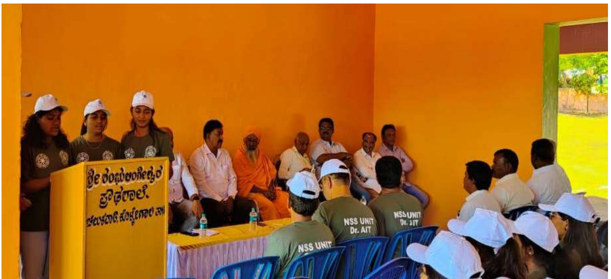
Invocation song by NSS Volunteers

The programme proceeded with speech given by the guests present for the ceremony. The opening ceremony was begun by seeking the blessings of that almighty.