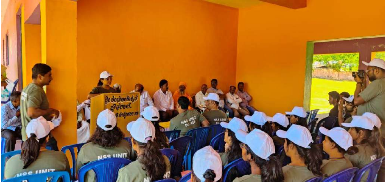
Anchoring by NSS Volunteer