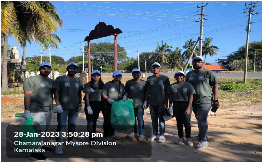
Cleaning and awareness at Chilkavadi