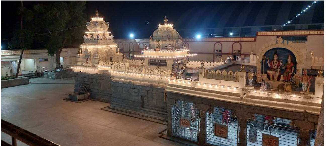
Visit to Male Mahadeshwara Temple