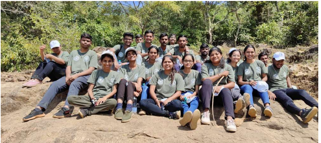
Trek towards Nagmale

Trekking is more challenging than hiking since it tests one's ability, endurance and their mental as well as psychological capacity. There are many different ways to do a trek and trekking culture often varies from country to country. It usually takes place on trails in areas of relatively unspoiled wilderness.