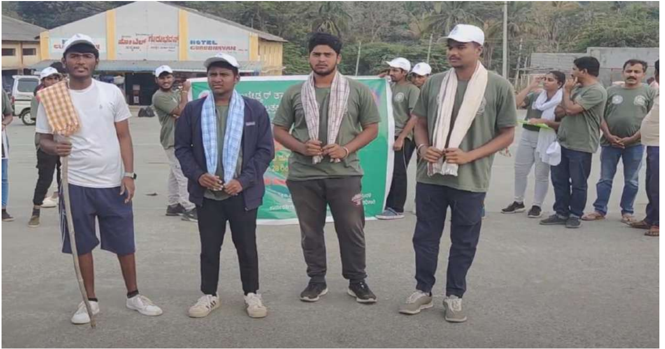
Part 3 of the play.

Aim : Avoid deforestation, Nature is our Future.